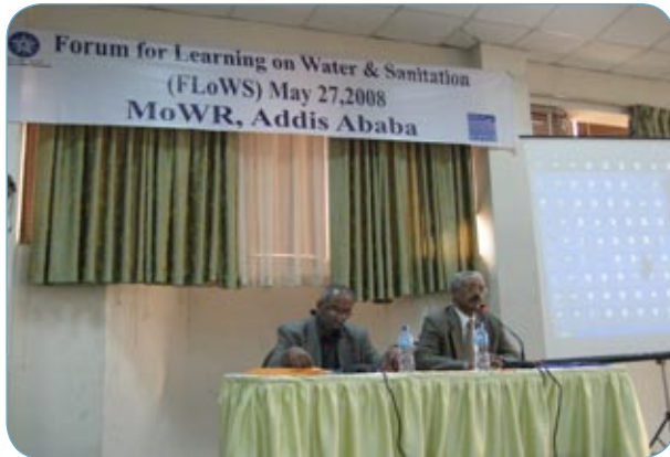
FLoWS launch event

There is a huge wealth of learning being generated by both researchers and practitioners in Ethiopia's water supply and sanitation (WSS) sector. A host of institutions across the country are now deeply involved in providing teaching, research and practical inputs to learning processes in the sector.