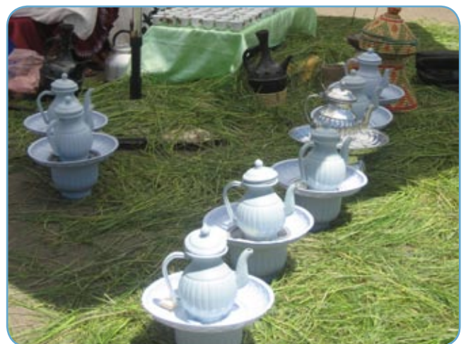
Global Hand-washing Day Celebration, Addis Ababa, 15 Oct. 2008