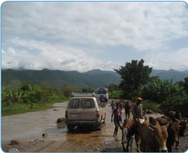
Many areas in Ethiopia already experience considerable water stress

rights to natural resources (land, grass, water, etc.) are disputed, this often leads to conflicts among different user groups. A second strand of activities therefore focuses on conflict management and conflict reduction strategies.