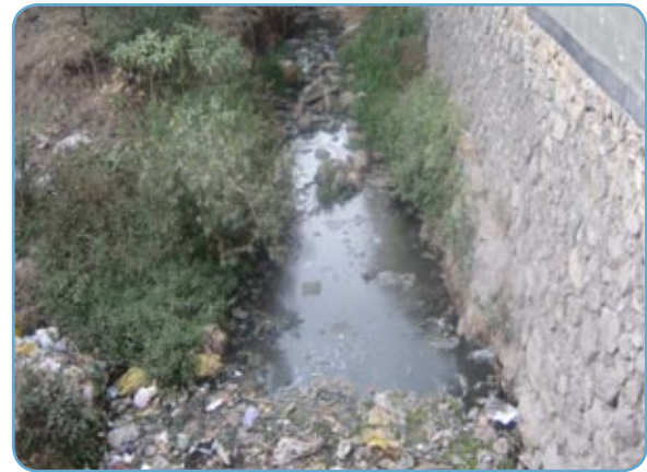
Sanitation is the worst off-track MDG target in Eastern Africa.

even worse position - if they maintain the current rate of progress they will not achieve the sanitation MDG before the next two centuries. Ethiopia is one of those three worst off-track countries.