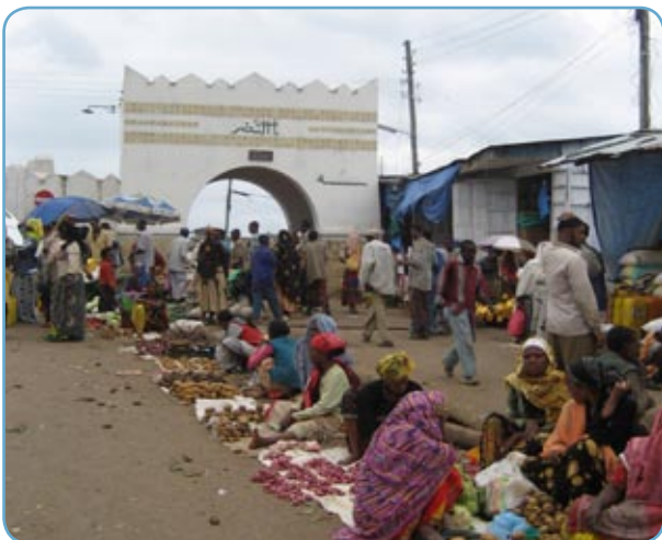
Market place at the heart of Harar

The central purpose of the LARS is to actively inform ongoing processes of programme implementation within the water supply sub-sector. The LARS will respond to the needs and priorities of local partners, but at the same time aim to generate research findings which are of relevance beyond the immediate study site and contribute to wider debates on sector policy and practice.