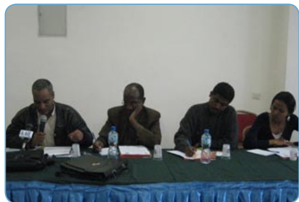
During the launching event

Members of the WASH sector and the media met in Addis Ababa in September 2008 and agreed to set up a WASH Media Forum to help bring together journalists and WASH sector actors to discuss and debate issues of interest. A WASH Media Forum has been proposed several times to enhance the partnership between the sector and the media and help achieve the country's commitments to increase water and sanitation access under the Millennium Development Goals (MDGs) and the Universal Access Plan (UAP).