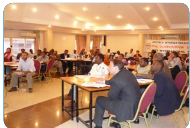
Participants of the 3 rd FLoWS meeting

In the future, in order to better link FLoWS events with the MSF, the presentations and major lessons from FLoWS will be published as an annual set of proceedings to be presented and distributed at the MSF.