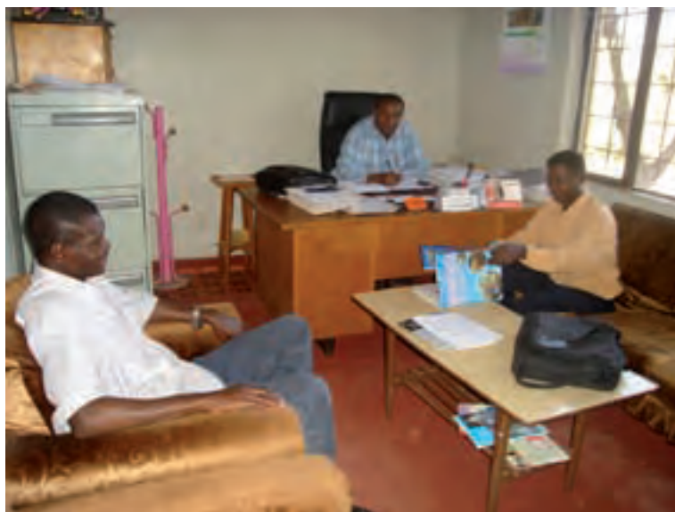
In Ethiopia, much of the decision-making happens at woreda or regional-level offices, in conjunction with implementing NGOs.

In Ethiopia, information about community needs in water and sanitation are held at the woreda level, but the community voices its needs at kebele level, which is then channelled to the local woreda Water Office. The woreda Water Office then prioritises community needs. Further to prioritisation by both woreda and NGOs, a feasibility study is conducted. Users are supposed to participate at every level, from needs identification to planning, apart from some technical design, such as depth of boreholes, which is carried out by water engineers. This research did not assess the quality of the participation.