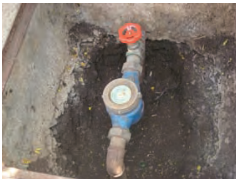
Metering is key in aiding cost recovery and financial sustainability in Kabuku.

In Kabuku, the community-managed network has tariffs set by the community members. Some of the water is distributed through a home network and the rest through public tap-stands. Monthly billing, a progressive tariff and strict enforcement of payment rules have enabled the scheme to maintain high average collection rates over many years. This financial discipline, together with each group's authority to set its own tariffs and to set and approve annual budgets, ensures that income collected is enough to cover all operating and maintenance costs. Having a set number of members, rather covering than the entire community, allows for easier management as well, but this may create barriers to entry.