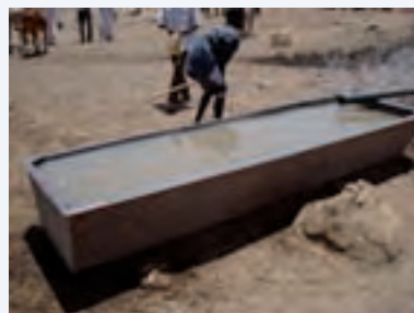
Comparing technology choices in cattle troughs: metal sheet troughs are easier to move around and carry, in comparison to concrete ones, which are sited.