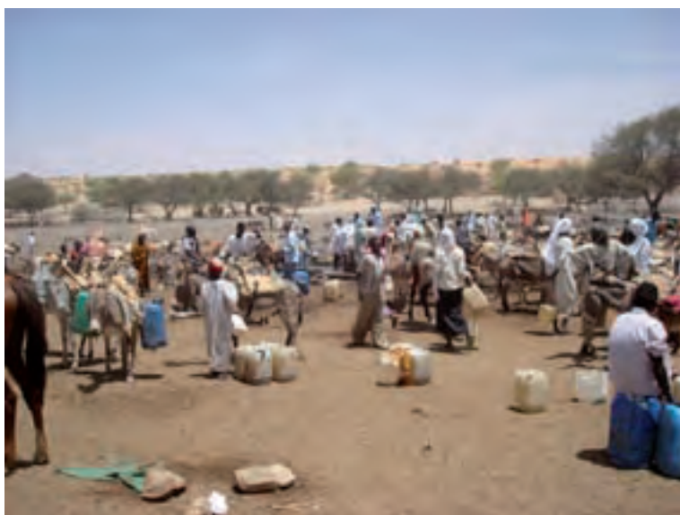
Conflict can wreck havoc on access to water, especially in areas that suffer from land scarcity.

As expected, land ownership was another issue arising as a point of contention in many cases. In Ethiopia, where land is a scarce resource in comparison with Sudan, conflicts had arisen over land ownership in most of the sites visited, particularly in the Ifa Jalela/Kufanzik case, where the water accessed by both communities is on land belonging to Ifa Jalela. As the water source and collecting chambers for both kebeles are on Ifa Jalela's land, the water is referred to as 'Ifa Jalela water'; as a result of this perceived ownership, bribes (or additional payments/non-agreed payments) are demanded from Kufanzik residents who want to access the water. Pipes have been sabotaged so that extra fuel money can be demanded and so that lack of water being delivered to Kufanzik can be blamed on this rather than on managerial failure. To counter these problems, Kufanzik residents in particular suggested that a local government official manages the scheme, since it is too large to be managed by the community.