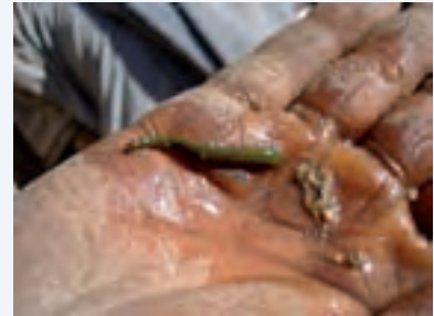
Prior to the system installation, the leeches in the unprotected water caused several health problems.

With the reconstruction of the spring-fed system, an integrated programme approach was implemented, including water supply, sanitation promotion, watershed management and irrigation, alongside cross-sector interventions in education and health. The system had been running for about four months at the time of visit, and already impacts were being seen in areas such as sanitation (showers, latrines), with now coverage of pit latrines now reaching 50% of households. Water was also used for livestock, irrigation and house construction (which uses mud). This has the attendant effect of reducing deforestation, mainly because mud substitutes for wood in house construction.