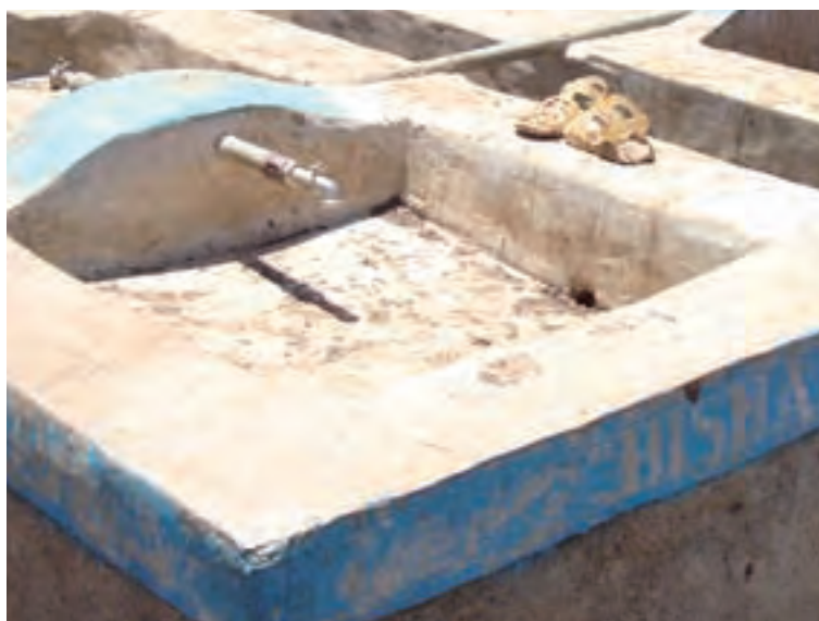
Designing systems that can be easily maintained is a challenge for rural communities who have limited access to spare parts.

As mentioned previously, water supply schemes are designed to resist normal flooding, although in some cases there are risks of major freak floods that can destroy the system. In other schemes, such as the improved natural pool in Azagarfa, an existing water source may become damaged if poorly designed and/or implemented. A design that avoids such risks increases the cost of the infrastructure. To deal with such difficult decisions in the choice of technology, good interaction is needed among designers, users and local government. What need to be avoided are situations such as that at Millennium Village, where the scheme was destroyed by a flood and nothing was put in place for