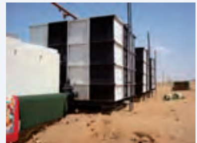
Golo dam (left) and sub-dam (middle) provide most of Al-Fasher's water. Golo's main dam runs dry towards the end of the rainy season, and there is reliance on the sub-dam, as well as the Shugra boreholes. Shugra boreholes feed storage tanks (right) in sShugra, and then the water is pumped to Al-Fasher town, whereas the water from Golo dams is pumped directly to Al-Fasher town and stored there.