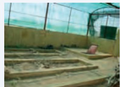
Local NGO works with women groups to create nurseries, but access is thwarted by the conflict.