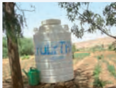
Tank that feeds irrigation for farms