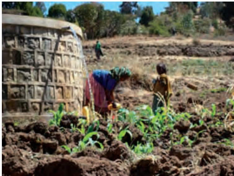
In Gorobeyo, villagers with access to irrigated land, have seen their incomes increase by more than 300%.

Equitable growth is always challenging in the short term and it is common for those with more resources and power to benefit first and most. Equitable economic outcomes from access to water are only possible if capacities are built across community groups to benefit economically from access to and use of water, whether directly or indirectly. This should be considered within the larger effort to determine how technologies can benefit all.