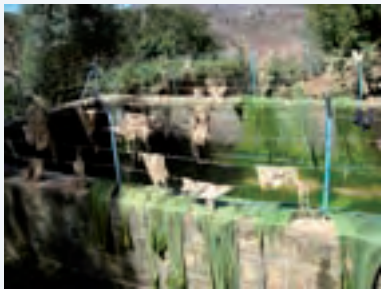
Water from the spring feeds two storage facilities. The storage pond (left) feeds irrigation channels and the storage tank (right) feeds the pump for drinking water, laundry and cattle troughs.