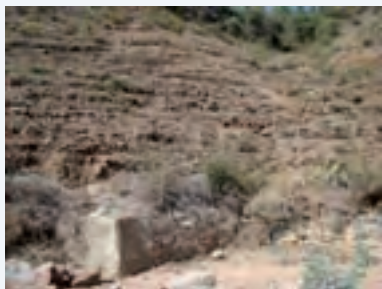
The capped spring has allowed for increased yield. Terracing in the hills is part of watershed management

Alongside WSS interventions, there have been simultaneous interventions in health, education and environment, as Millennium Village is a pilot for testing out cross-sectoral programme interventions. Overall, the heavy investment has had a major impact with regard to lifting people out of poverty.