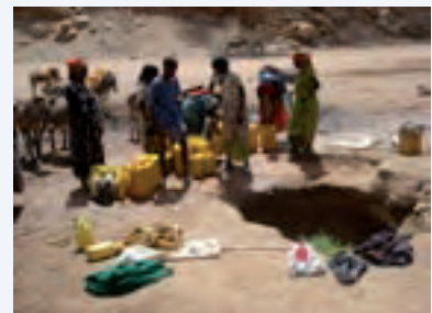
From hand-dug wells which are unprotected