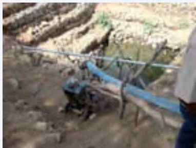
Well and pump that feeds tank

The testing, carried out in full partnership with farmers, has shown the advantages and disadvantages of the different techniques. The farmers reflect on their preferred methods by describing the technologies and then listing their pros and cons. Furrow irrigation is simple but uses a large quantity of water, and leads to weed growth and soil compaction and cracking. The 'improved' drip irrigation saves water, is easy to manage and does not lead to problems with soil cracking, but evapo-transpiration is high. Traditional drip irrigation, which consists of plastic bottles buried near the root zones of plants, is also an efficient way to use water, but is harder to manage,