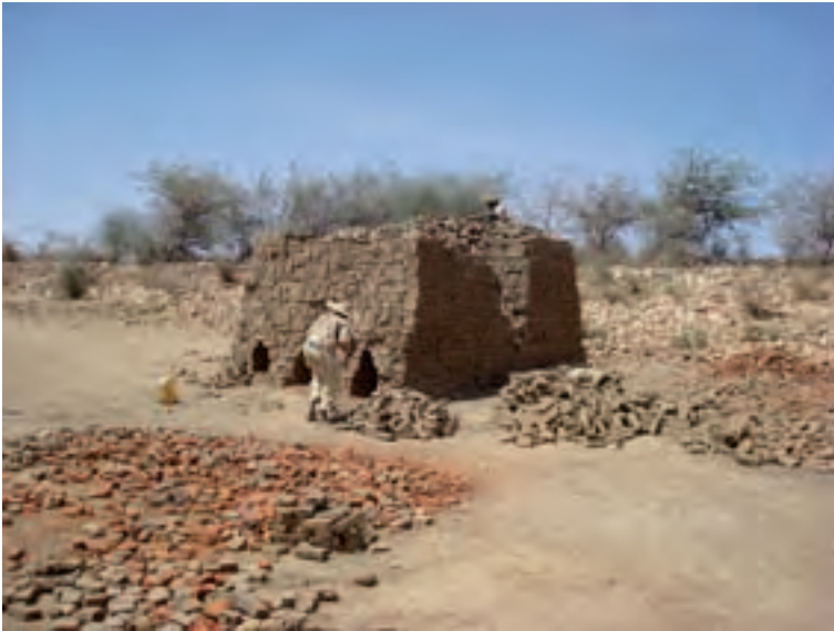
Introducing more environmentally-friendly ways to make bricks is one of the lessons that can be learnt between villages in the region.

hence the increased income, and are now looking to obtain assistance in order to remove the middlemen and access the market directly themselves. In Kenchera and Millennium Village, farmers can now earn an additional income from selling surplus vegetables. Kenchera has links with a women's processing project