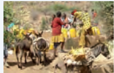
Some people here get drinking water from hand pumps or...