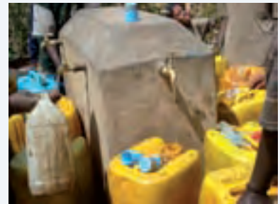
System is a motorised pump which feeds storage tanks, with distribution points that are fed by gravity. The functioning distribution points are the taps where water is collected for domestic use.