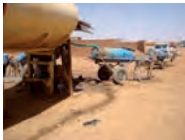
Snapshots from the field study. Upper row: Ethiopia. Lower row: Sudan