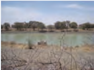
Twin hafirs feed the nearby water yard, through wells. There used to be a storage tank, but this has gone into disuse due to the conflict. There is currently no control over access. Disused wells are guarded against people or animal falling in and the water is not treated.

Owing to the limited access to groundwater, it is believed that water from the ponds is used for human consumption, with adverse implications for human health. There is therefore an urgent need to set up a system to treat the water. Access to water for domestic use and livestock in such close proximity could address the multiple needs of the community. However, special care would have to be taken to avoid contamination, and the ongoing conflict in the area makes improving any water source a difficult prospect.