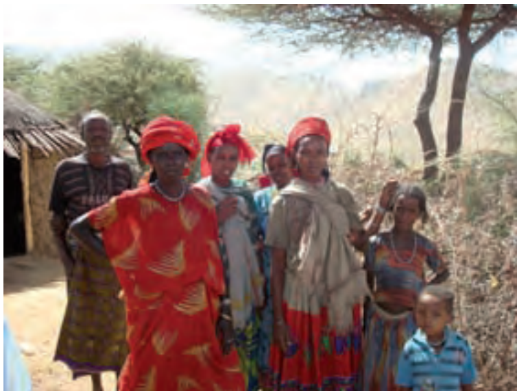
Having a management system that aims to address the spectrum of community needs, especially women, is essential.

In short, actions and capacity of stakeholders are a key determinant of how sustainable a system is. Generally, in terms of water management, committee structures should be more context specific and tie in, as much as possible, with existing managerial institutions, or be flexible enough to be adapted by communities. In other cases, external stakeholders, outside of beneficiaries, are better suited to managing systems and keeping the system accountable and transparent.