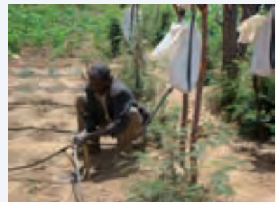
Different types of drip technology being tested out by farmers: Plastic bottles, Tin cans and 'improved' irrigation