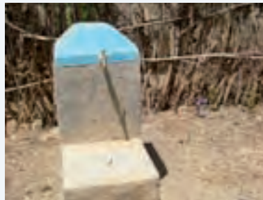
Left: Due to the mismanagement, most taps have not seen water in months. Below: The design engineer listens for water filling the tank in Kufanziq for the first time in months.

From Top down: Motorised pump which feeds storage tank, that is dispersed by gravity to pumps in Ifa-Jalela. The pump also feeds a second storage tank on the border with Kufanzik (right).