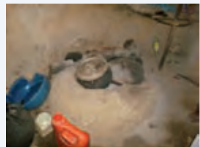
Alongside water and sanitation interventions, the NGO introduced brick making to reduce reliance on wood for buildings, and home management programmes including domestic facilities such as laundry and improved stoves.