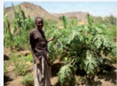
The water from the spring, goes via a storage tank to distribution points and cattle troughs. Farmers can now grow produce for sale.