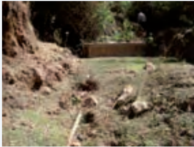
Left: Gorobeyo is fed by a capped spring supply that helps increase the discharge of a spring

Again, land rights issues were identified as key, with access to a cattle trough denied by the owner of the land, as the land was being degraded by people accessing the water point. This issue was still under discussion at the time of writing.