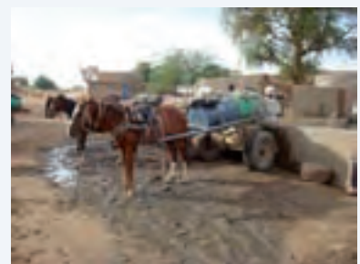
The water is pumped up from the well, to a storage tank and then fills water tanks pulled by horses.